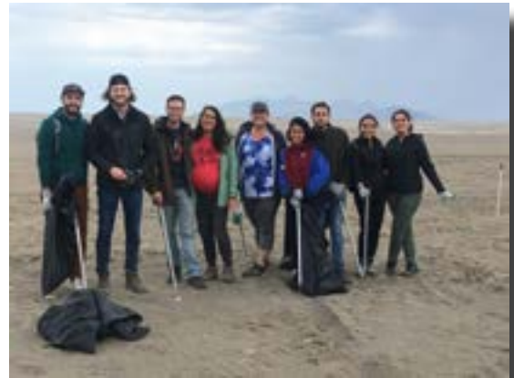
International Coastal Cleanup Day 2022 near Saltair

Please wear clothes you can get dirty and shoes appropriate for mud and sand. As a precaution, bring a backpack with water, a raincoat and rain pants. It rained on us the last two years! Gloves, trash bags, and other cleanup supplies will be provided. For more information or to register for the event, please visit https://tinyurl.com/mrytsw9z and click on Get tickets .