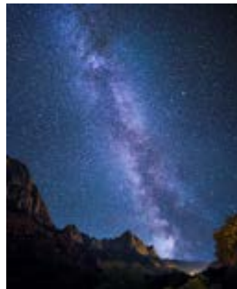
The Watchman, Zion National Park

Are you interested in exploring the night sky? Want to find places in Utah to see the stars? The Dark Sky Passport is a tool you can use to create a sense of awe and connection by exploring naturally dark skies and the stars they reveal. The passport focuses on National and State parks that are designated or are actively applying to be Dark Sky Parks, or have regular dark sky programming, including