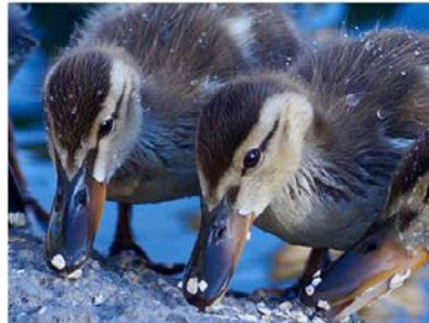
Birdwatching for Kids

See our Instagram @greatsaltlakeaudubon for more.