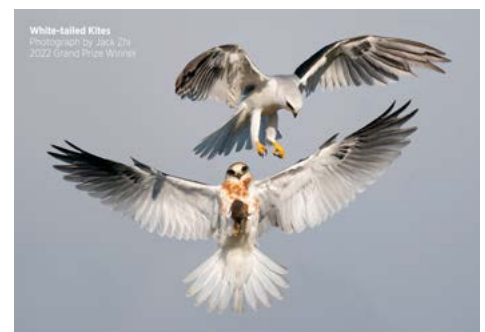
White-tailed Kites 2022 Grand Prize Winner

The winning photographs and videos are amazing, so you will not want to miss this opportunity to experience these works. The exhibition is traveling around the United States and we are pleased to be on the list of exhibitors.