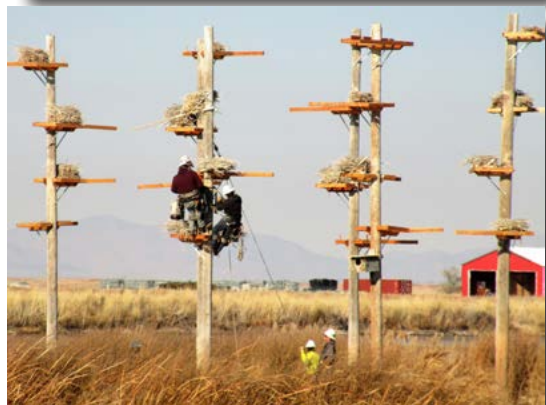
Bottom RMP linemen attaching platform at heron rookery celebration day at FBWMA.