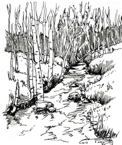
Illustration by Margaret Pettis ©

Session description: Exploring and using some basic skills in line and watercolor wash, we'll depict what we observe in the world around us. Then, using a brush and natural stylus, we will create several small sketches and a formal watercolor and ink notecard design that reflects the intricate beauty of this place.